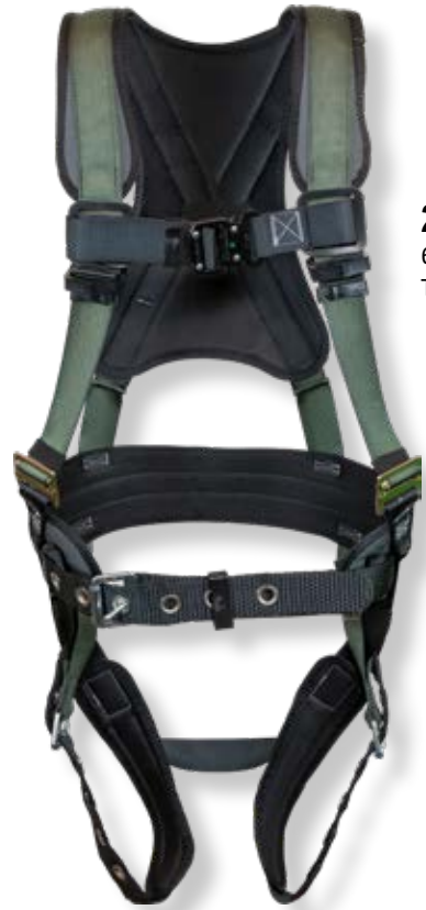
22850 6-point adjustment with waist pad Tongue buckle/grommet legs