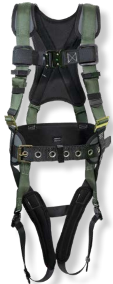
22870 6-point adjustment with waist pad Bayonet leg buckles