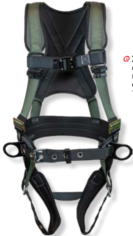
22850B 6-point adjustment Hip positioning D-rings Comfort waist pad Tongue buckle/grommet legs