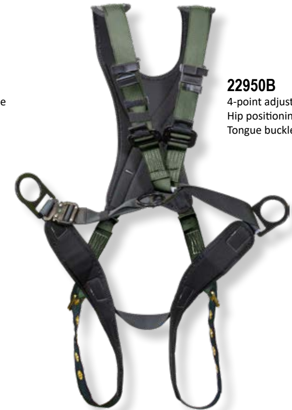
22950B 4-point adjustment cross-over style Hip positioning D-rings Tongue buckle/grommet legs