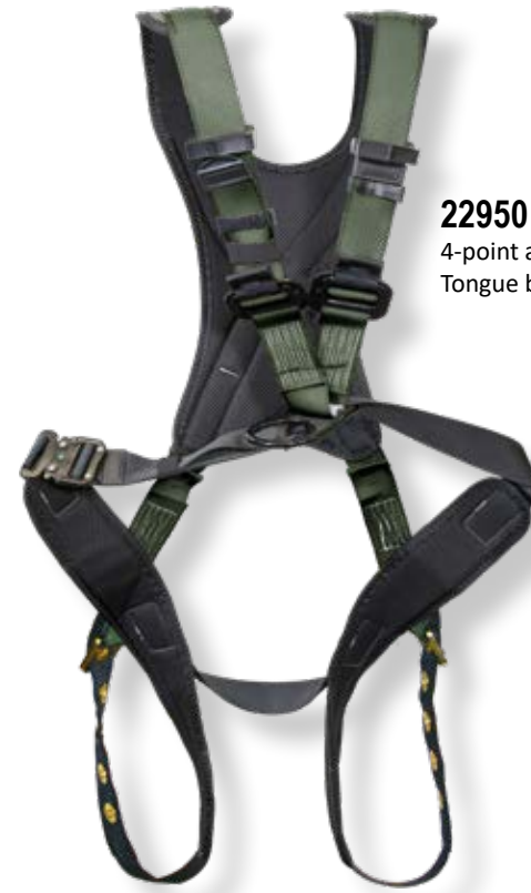
22950 4-point adjustment cross-over style Tongue buckle/grommet legs