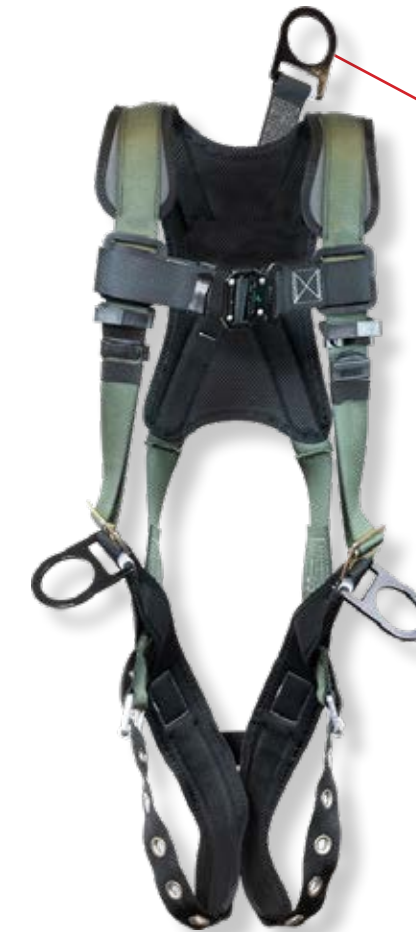
226509B 5-point adjustment Hip positioning D-rings D-ring extension Tongue buckle/grommet legs