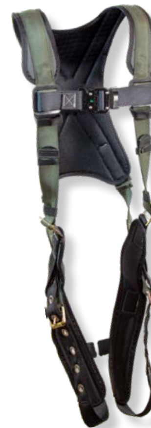
22650 5-point adjustment Tongue buckle/grommet legs