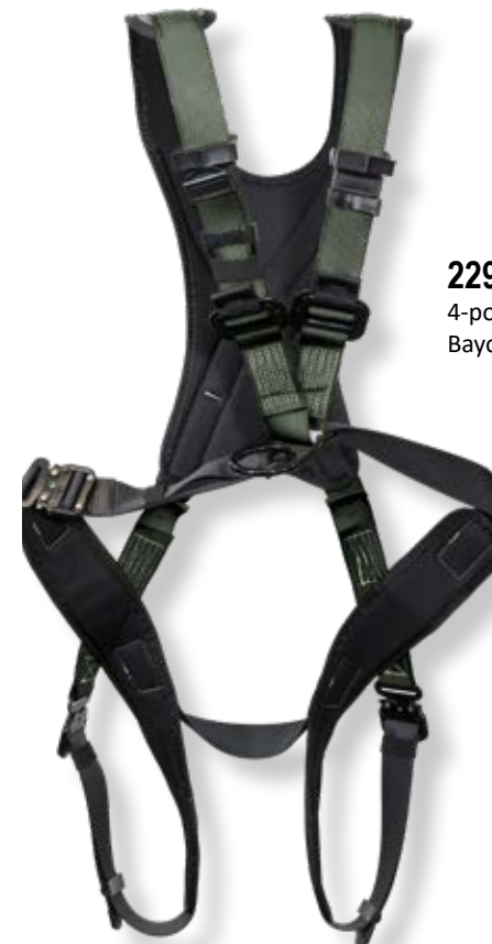
22970 4-point adjustment cross-over style Bayonet leg buckles