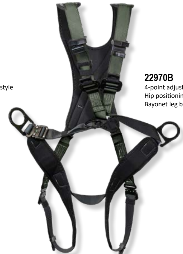
22970B 4-point adjustment cross-over style Hip positioning D-rings Bayonet leg buckles