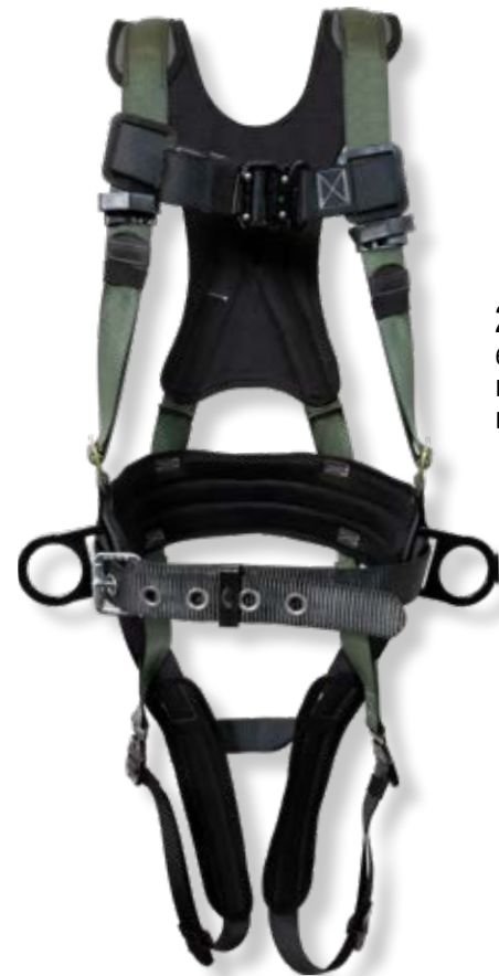
22870B 6-point adjustment Hip positioning D-rings Bayonet leg buckles