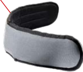
Additional comfort padding