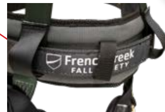
Additional equipment/gear loops