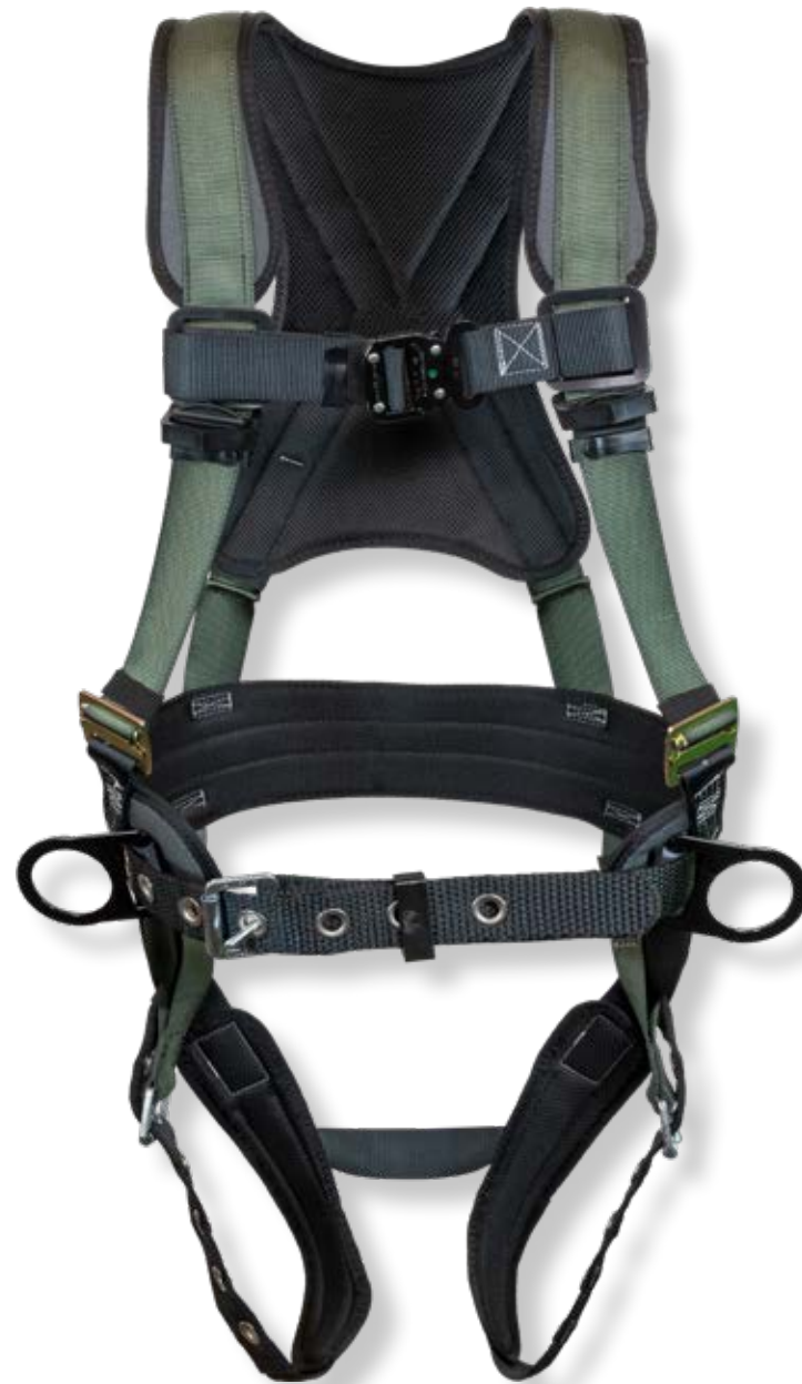
22850B 6-point adjustment with comfort waist pad Hip positioning D-rings Tongue buckle/grommet leg adjustments