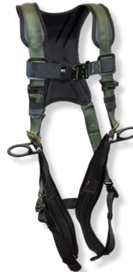
22650B Ⓢ L-XL size quickship only 5-point adjustment Hip positioning D-rings (No D-ring extension) Tongue buckle/grommet legs