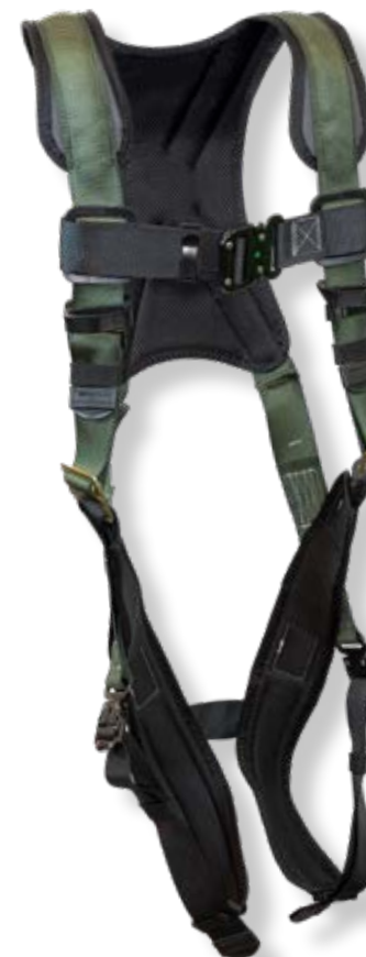
22670 5-point adjustment Bayonet leg buckles