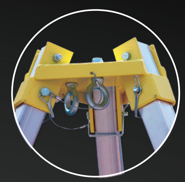
Close-up of tripod head attachment points

S50SS-M7 - TP7 tripod, R50SS rescue unit, MW50G work winch.